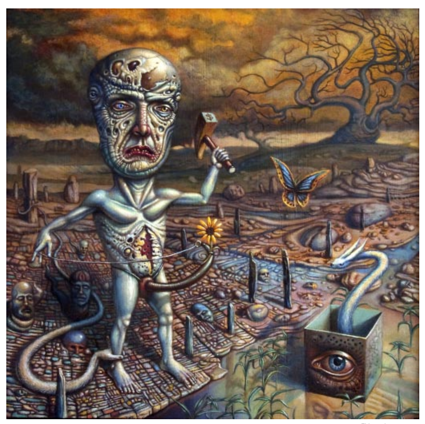
Title etc here.....

In my work Go Devil the device that clears the way is a male figure, part human with a serpentine tail in place of legs. I envision the figure as dwelling in the sky. He destroys in order to make room for a personal shift in perspective. The Go Devil is not necessarily evil or wrong, even though he carries a spirit of death in a cage on his head. The Go Devil casts no judgment, but serves the will of what I believe to be the truth. I think of the painting as a confession, and the beginning of a healing process.